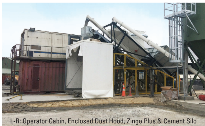
L-R: Operator Cabin, Enclosed Dust Hood, Zingo Plus & Cement Silo