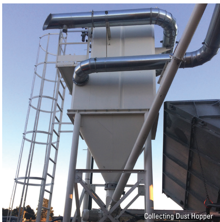
Collecting Dust Hopper